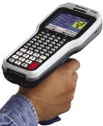
An optional user-installable and removable pistol grip handle is ideal for highly repetitive scanning.