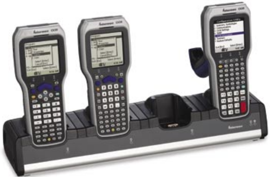
The CK30 batch model readily fits into a single or 4-bay communication dock with USB, RS232 or Ethernet host connectivity.

The device offers new linear imagers that deliver reliability and ideal scanning capabilities for arm's length scanning applications. Users are also able to select laser scanners for either standard range or long-range applications. Additionally, an area imager option also supports 2D symbologies, and users can attach tethered scanners for additional ergonomic flexibility.