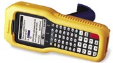
An optional protective rubber boot extends durability in extreme environments.

Web-based applications can easily be implemented either through Intermec's text-based dcBrowser™ or the bundled lock-down browsers based on Pocket Internet Explorer or IE6.